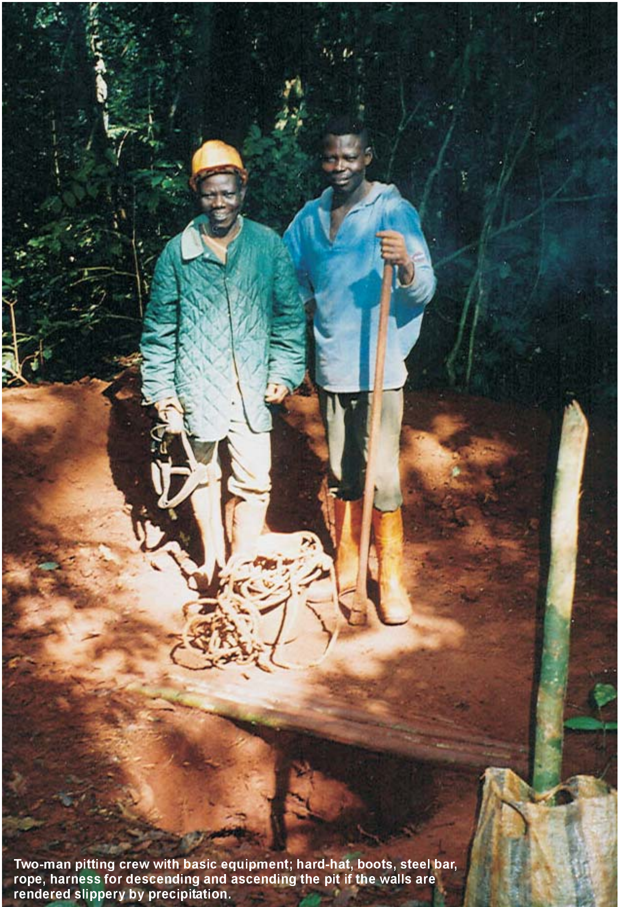
Two-man pitting crew with basic equipment; hard-hat, boots, steel bar, rope, harness for descending and ascending the pit if the walls are rendered slippery by precipitation.