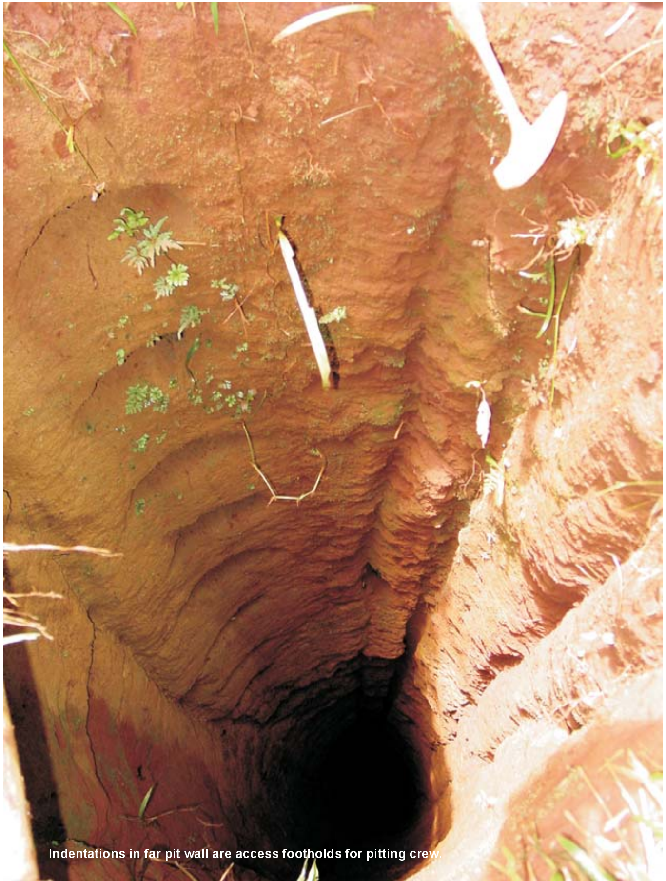
Indentations in far pit wall are access footholds for pitting crew.

Prepared by PINCOCK, ALLEN & HOLT 165 S. Union Boulevard, Suite 950 Lakewood, Colorado 80228 Phone (303) 986-6950